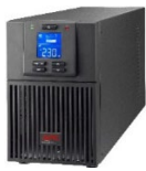
Easy UPS 1K & 2K Tower