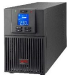
Easy UPS 1K & 2K Tower

References / Referenz : SRV1KI, SRV1KIL, SRV1KRI, SRV1KRIRK, SRV1KRIL, SRV1KRILRK, SRVPM1KIL, SRVPM1KRIL, SRV2KI, SRV2KIL, SRV2KRI, SRV2KRIRK, SRV2KRIL, SRV2KRILRK, SRVPM2KIL, SRVPM2KRIL, SRV3KI, SRV3KIL, SRV3KRI, SRV3KRIRK, SRV3KRIL, SRV3KRILRK, SRVPM3KIL, SRVPM3KRIL, SRV6KI, SRV6KIL, SRV6KRI, SRV6KRIRK, SRV6KRIL, SRV6KRILRK, SRVPM6KIL, SRVPM6KRI, SRVPM6KRIL, SRV10KI, SRV10KIL, SRV10KRI, SRV10KRIRK, SRV10KRIL, SRV10KRILRK, SRVPM10KIL, SRVPM10KRI, SRVPM10KRIL, SPM1KL, SPM2KL, SPM3KL, SPRM6KL, SPRM10KL, SPRM1KL, SPRM2KL, SPRM3KL, SRV36BP-9A, SRV72BP-9A, SRV36RLBP-9A, SRV72RLBP-9A, SRV192RBP-7A, SRV192RBP-9A, SRV240BP-9A, SRV240RLBP-9A